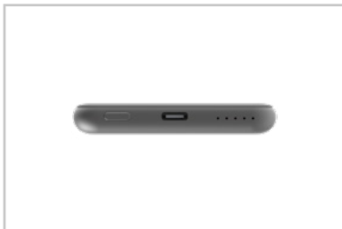
32244 - Front Angled