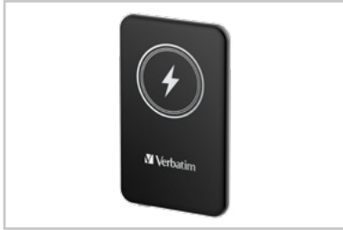
32240 - Front Angled