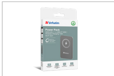
32244 - Packaging 3D