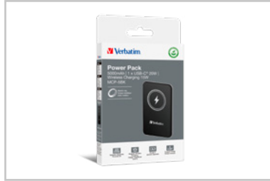
32240 - Packaging 3D