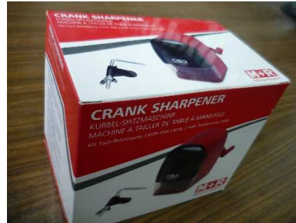
Crank sharpener in 1er box